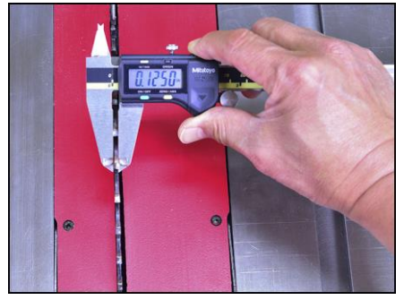
1. With your table saw unplugged, measure the width of the carbide teeth.

Note: Run-out varies from table saw to table saw, saw blade to saw blade, or a combination of both. Each calibrated MATCHFIT Setup Gauge works with only one saw blade and table saw combination.