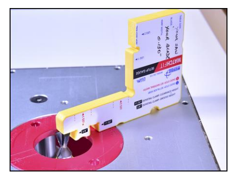
Use the 3/8'' height slot to set the 1/2'' 14 degree router bit height.