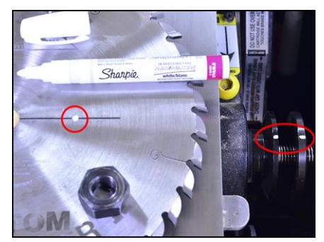
2. Using an oil-base paint pen, draw reference dots on the Arbor flanges, saw blade, and stiffener (if applicable).