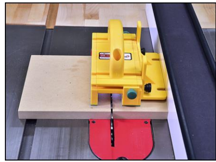
4. Rip a piece of {}^{3}/_{4} " MDF to 4" wide. Do not move the fence until after Trimming (Step 8) is complete. Note: MDF is better than solid wood or plywood for this application.