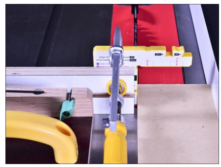
7. With the MATCHFIT Setup Gauge just touching the MDF, push the miter gauge forward and backward slightly, making sure the Setup Gauge does not drag along the MDF.