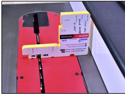
If clearance slot is desired, use the {}^{11}/{}_{32} " height slot for clearance slot (for saw blade or {}^{1}/_{4} " router bit).