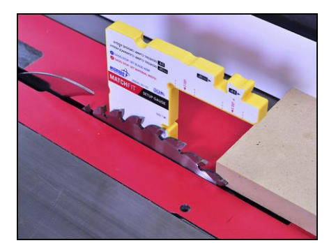
5. Place the MATCHFIT Setup Gauge next to the blade. Raise the saw blade to the center of the notch.