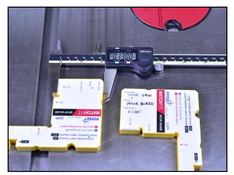
9. Measure the width of the upper vertical of the Setup Gauge: