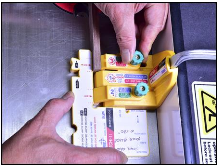
11. You can use the Setup Gauge as a square to set Leg #3 on the Dado Stop with the stock to be inserted in the dado.