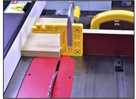
6. Using a MATCHFIT Dovetail Clamp, attach the Setup Gauge to the Miter Gauge so it is just touching the edge of the piece of MDF and sits square on the table saw top.